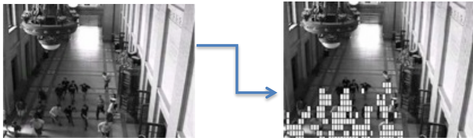
Figure 2. An example of an abnormal movement detection in a public place.

The tracking algorithm is generally initiated by a human action or by applying some simple rules as the object detection in forbidden regions delimited by the operator. In this project, we aim at making this decision automatically taken by the smart camera. The tracking process is initiated when the camera detects an abnormal behavior based on the real-time analysis of the video stream. The abnormal behavior is defined as the deviation from a normal behavior assumed to occur during a certain period. In other words, the camera considers a predefined period as describing the normal behavior of the scene. This database could be improved by integrating some situations considered to represent some dangerous abnormal situations. The objective of the on-line implemented algorithm is to efficiently and timely detect any abnormal situation (for example, abnormal group movements in crowded scenes, see figure 2 for some instances of abnormal group motion in public places and preliminary results based on SVM algorithms proposed in [6,7]).